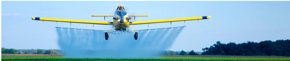
Kilborn Aviation spray plane on the job in 2018. (file photo)